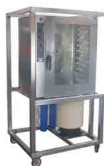
Item 147 (10 Tray pictured)

Bench top convection oven, 4 shelves, fits 460 x 660 full size sheet pan. This unit comes on trolley. Approx weight 70kg. W840 x D730 x H1580 (Offstand H580)