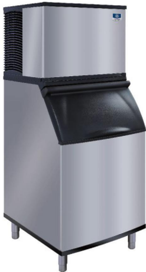
M700 Ice Machine on A570V Bin

Model: MD0700A-251B MY0700A-251B MD0700W-251B