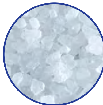
Ice shown actual size

Flake ice is small hard bits of ice ideally suited for presentation applications.