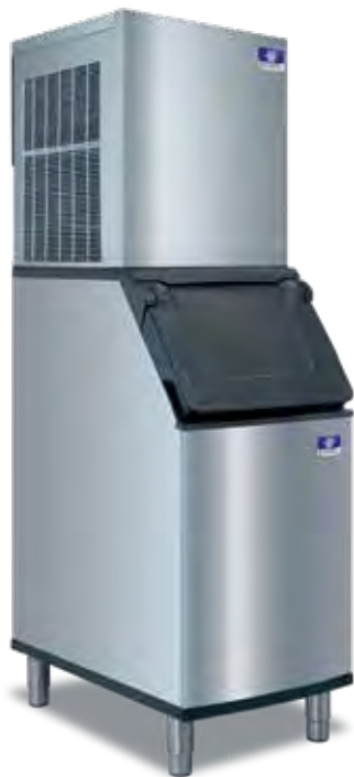
Model RFK-0320A Flake Ice Machine on D-420 Bin