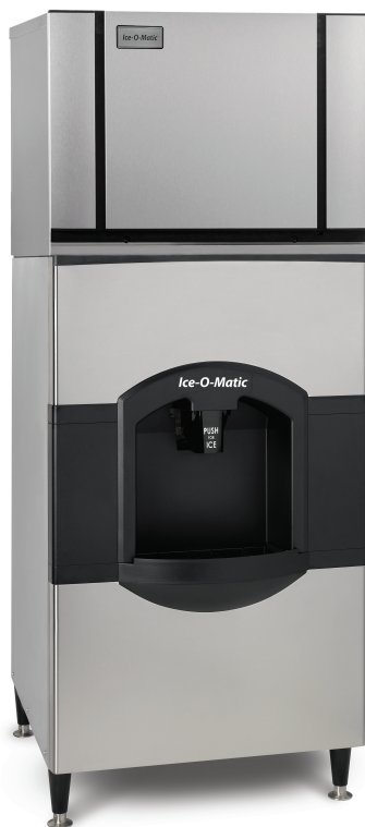
CD40530 WITH CIMO435