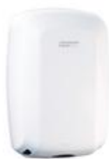
M09A White finish