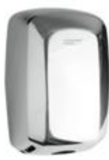
M09AC Bright finish