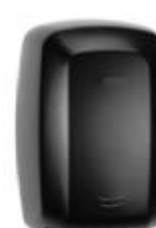
M09AB Black finish