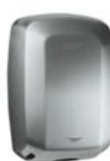
M09ACS Satin finish