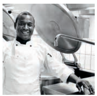
Central kitchens and airport catering

Electrolux Professional has achieved unprecedented flexibility in product manufacturing, opening a new era for chefs