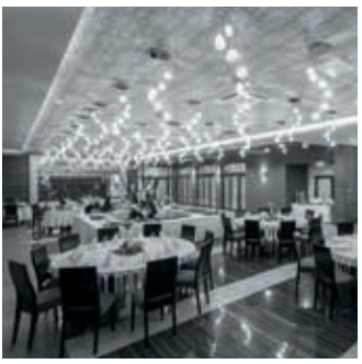
Big hotels and restaurants

hospitals, cafeterias and big hotels or restaurants. Choose among the extensive range of product typologies offering tilting or stationary boiling, braising and pressure boiling and braising pans in different sizes, with different features and possible configurations.