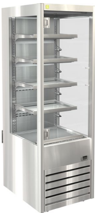
Shown with optional frameless hinged acrylic front door sold as accessory kit