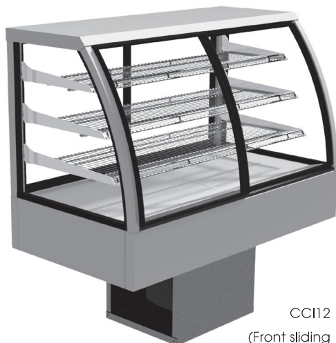
CCI12 (Front sliding door option)