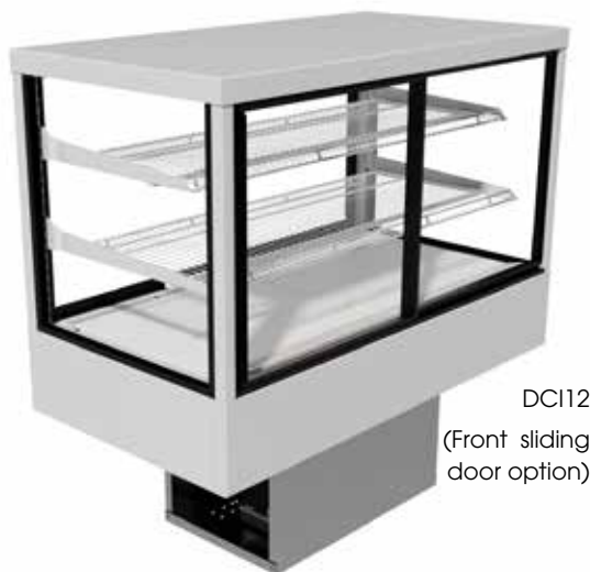
DCI12 (Front sliding door option)