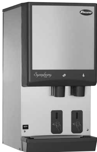
Shown with SensorSAFE™