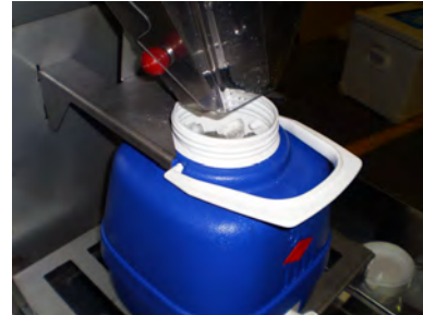
Jug Filler Dispenser Attachment

The perfect solution for employees working in mines, on construction sites, LNG industries or tough working conditions that require ice for hydration.