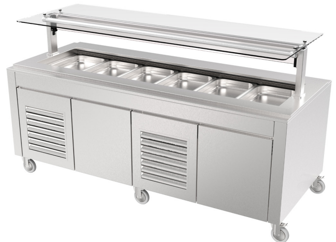
Showing : Inline GN Series Mobile refrigerated 6x 1/1 pans, fitted with flat self-serve gantry (option) and GN pans (accessories)