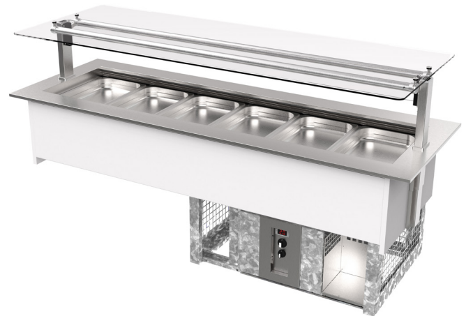
Showing : Inline GN Series refrigerated in-counter 6x 1/1 pans, fitted with flat self-serve gantry (option) and GN pans (accessories)