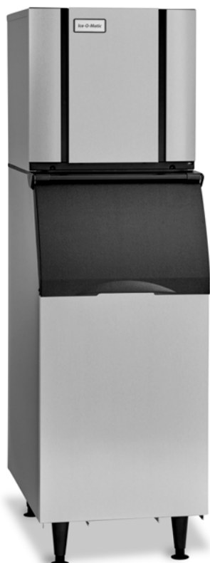
CIMO525 ON B42