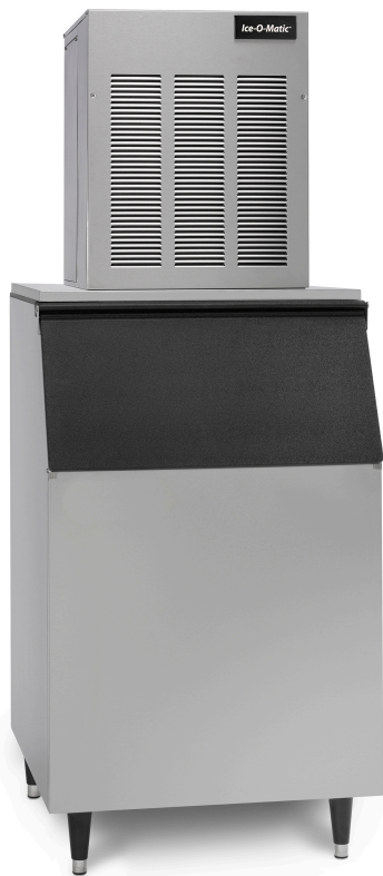
MFIO805 ON CIB230