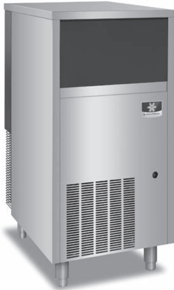
Model UFK-0200A Flake Ice Machine