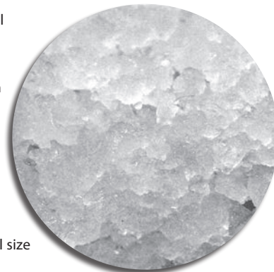
Ice shown actual size

Flake ice is small hard bits of ice ideally suited for presentation applications.