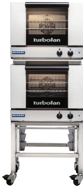
Model E22M3/2C shown

Double Stacked on a Stainless Steel Base Stand