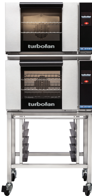
Model E23T3/2C shown

Half Size Electric Convection Ovens TOUCH SCREEN CONTROL Double Stacked on a Stainless Steel Base Stand