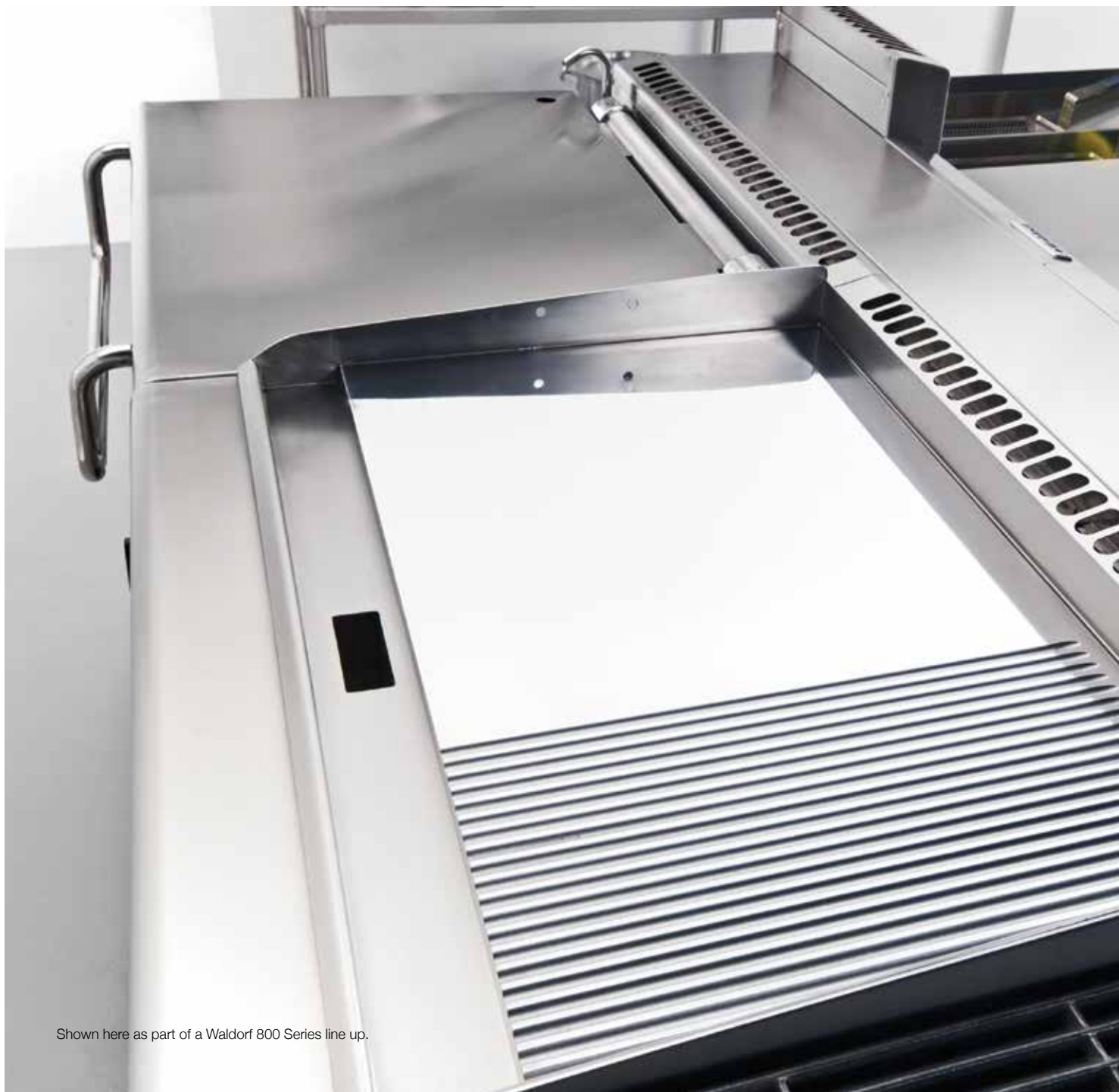
Shown here as part of a Waldorf 800 Series line up.

Drop down door with welded frame Fully welded and vitreous enamelled oven liner Cool touch stainless steel door handle Easy clean, installation and service