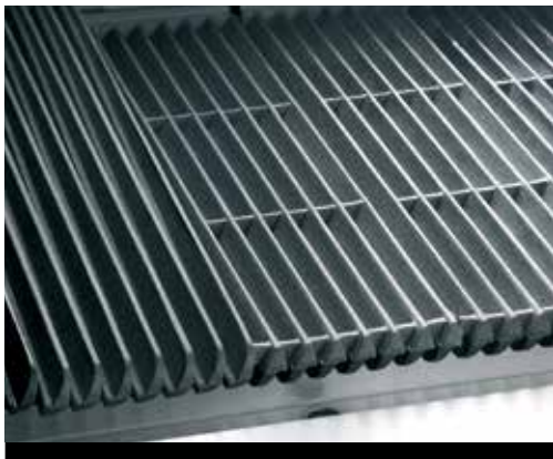
Heavy-duty reversible grates for level or inclined use.

Ask for a detailed specification sheet on any of the Waldorf Bold Chargrills outlining construction, features, options and installation information.