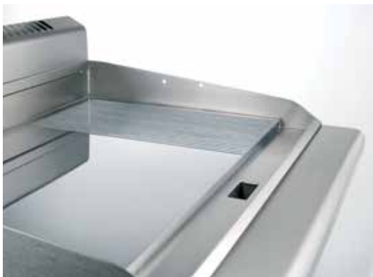
Mirror chromed griddle plate with a combined smooth and ribbed surface.