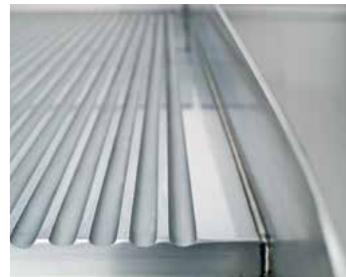
The 3mm splashguard is a fully welded hob surround providing extra durability.